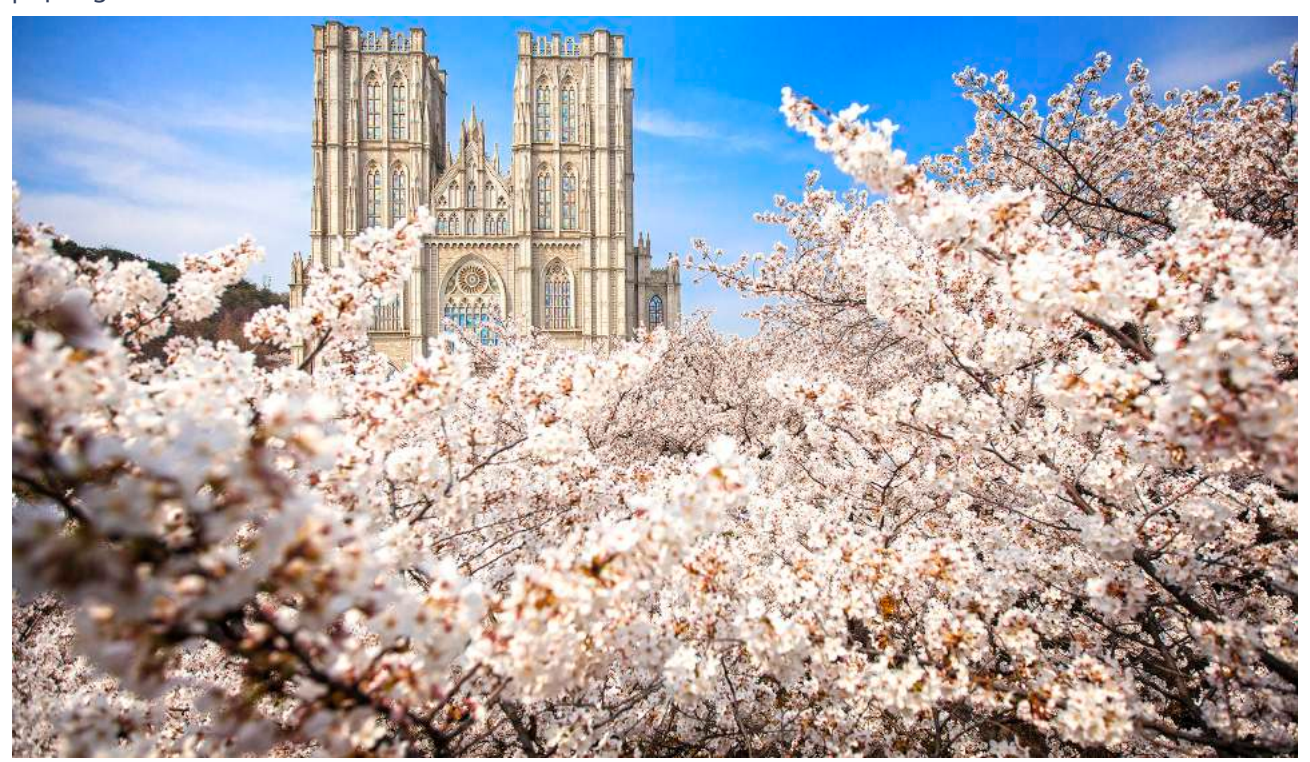
| Summer Seoul Campus scenery