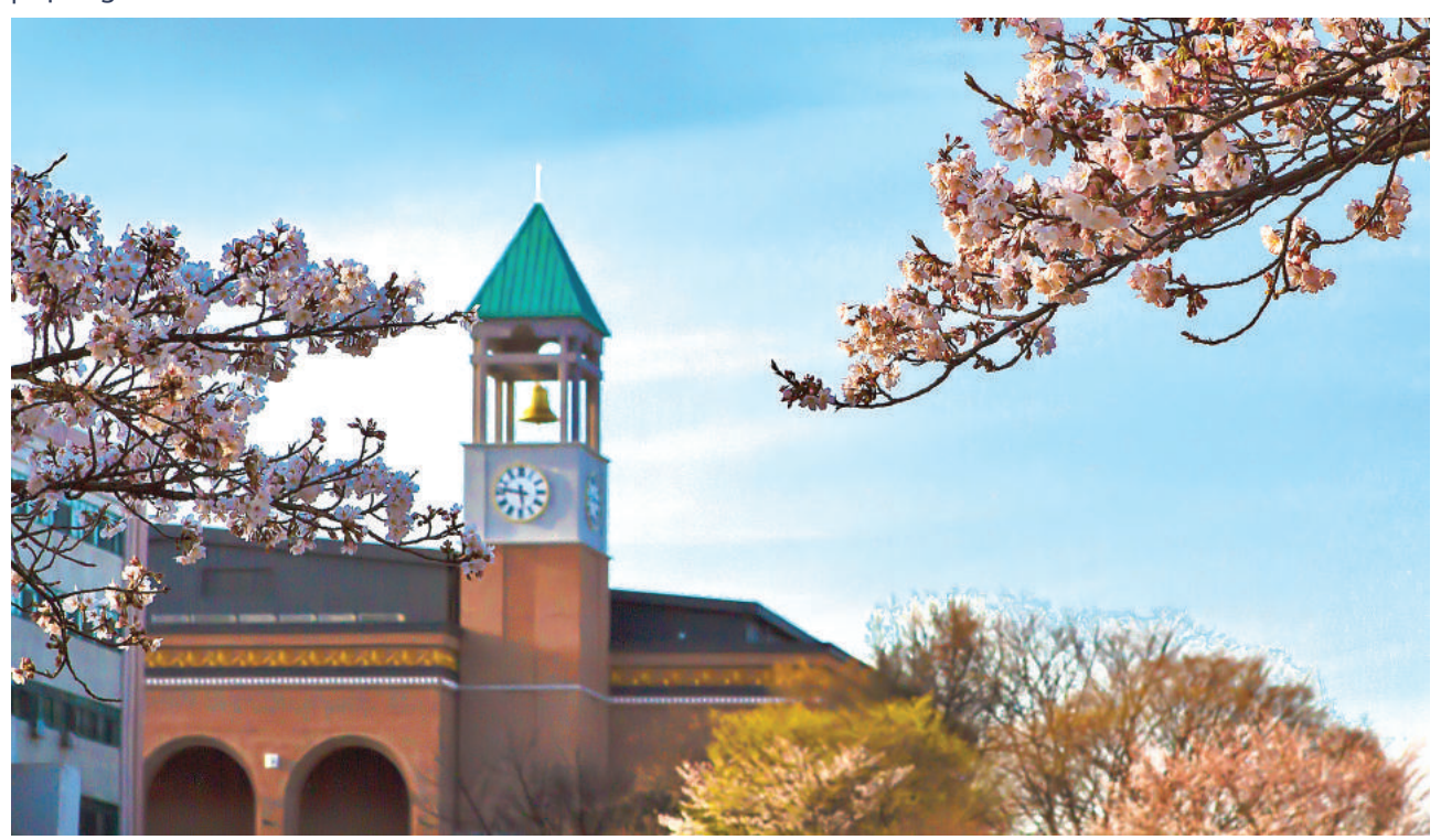
| Summer Central Library (University Administration Hall)