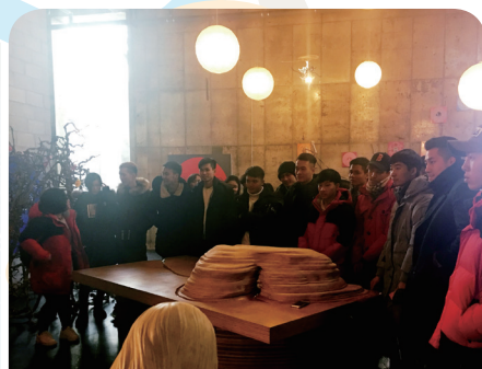
Art Culture Experience