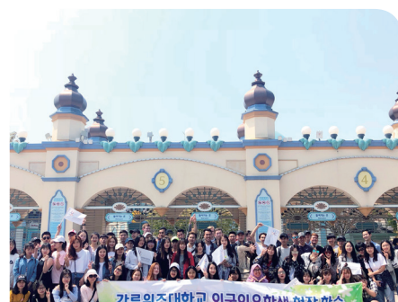
Amusement Park Visit