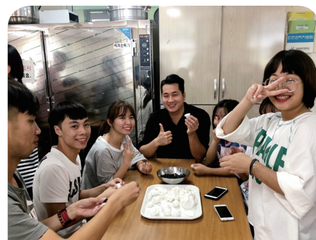
Korean Food Making Experience