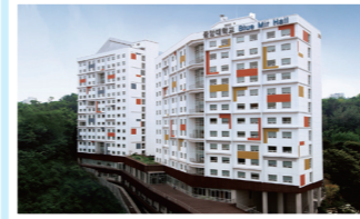
Blue Mir Hall(On-Campus Housing)