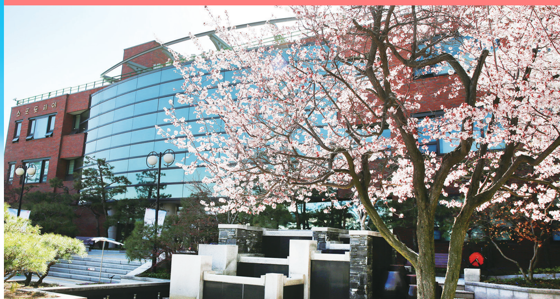
KYUNG-IN WOMEN'S UNIVERSITY