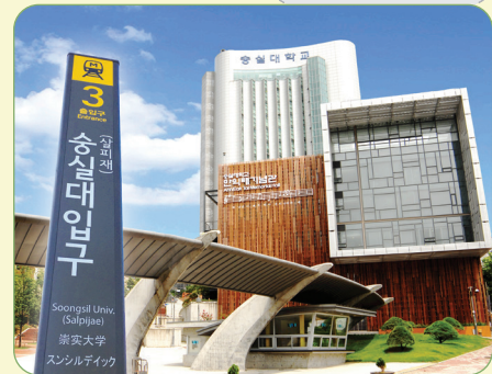
Subway Station Line #7 (Soongsil University Station)