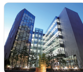
Soongsil Residence Hall

* Dormitory fees and residence schedules are subject to change.