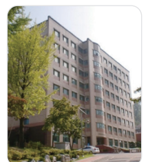
Global Brain Hall