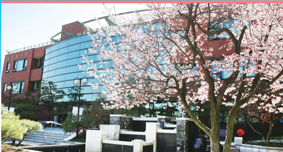
KYUNG-IN WOMEN'S UNIVERSITY