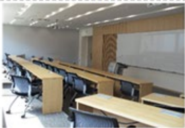
Lecture Theatre, 1F, Bldg. 57-1