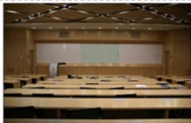
<SK Conference Hall, 1F>