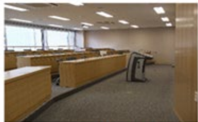
Lecture Theatre, 3F, 4F, Bldg. 57-1