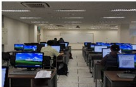
Computer Lab, B1