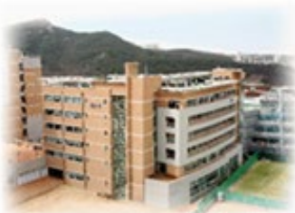
Whole view of GSPA Bldg. 57-1