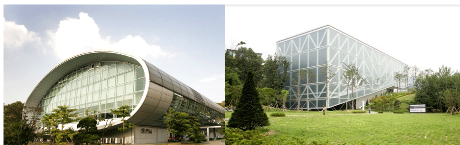
POSCO Sports Center