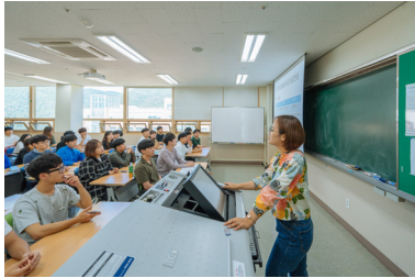
Advanced Lecture Halls/Total Lecture Halls: 473 out of 533 (89%)