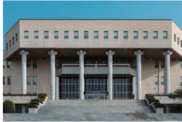
Library: 4,533 seats