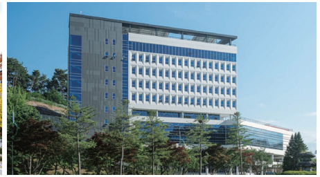
Samcheok Campus (Including Dogye) (Area 630,517m 2 )