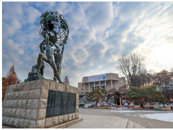
Chuncheon Campus (Area 1,001,311m 2 )