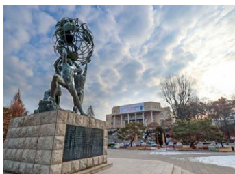
Chuncheon Campus (area: 1,001,311m 2 )