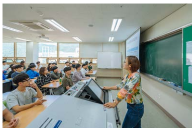
473 state-of-the-art classrooms, a total of 533 classrooms (89%)