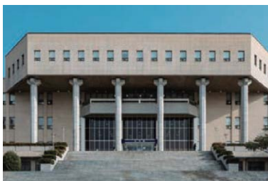
Library seating capacity: 4,533 seats