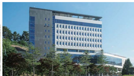
Samcheok Campus (incl. Dogye) (area: 630,517m 2 )