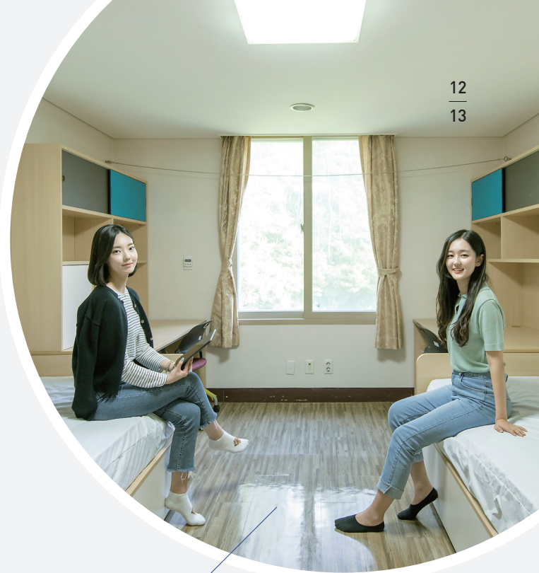
Dormitory (Double room)