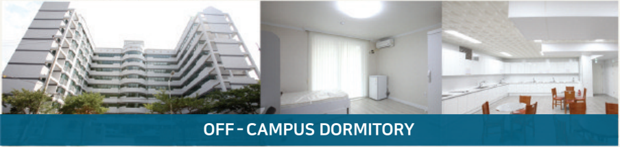
OFF - CAMPUS DORMITORY