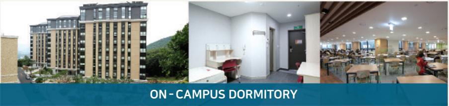
ON - CAMPUS DORMITORY